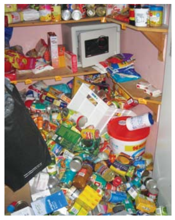
Safe House pantry after 6.3 shake

Welcome to our first newsletter of the year. We know that many of you will have experienced loss in varying degrees in the last few months and Christchurch Women's Refuge extends our sincere sympathy and support to you all.