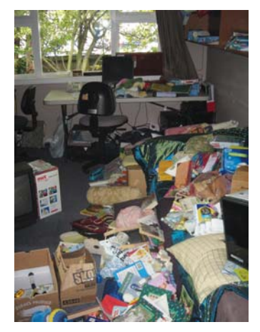
A Safe House bedroom/office after the big shake.

Throughout the earthquake and its aftermath we maintained 24-hour telephone support and our amazing clinical staff literally drove the crisis phone to each other to ensure the line was always available. We had