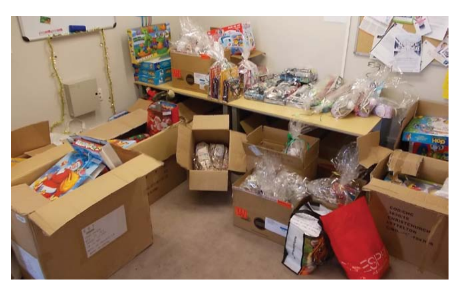
Just some of the very many gifts you gave at Christmas