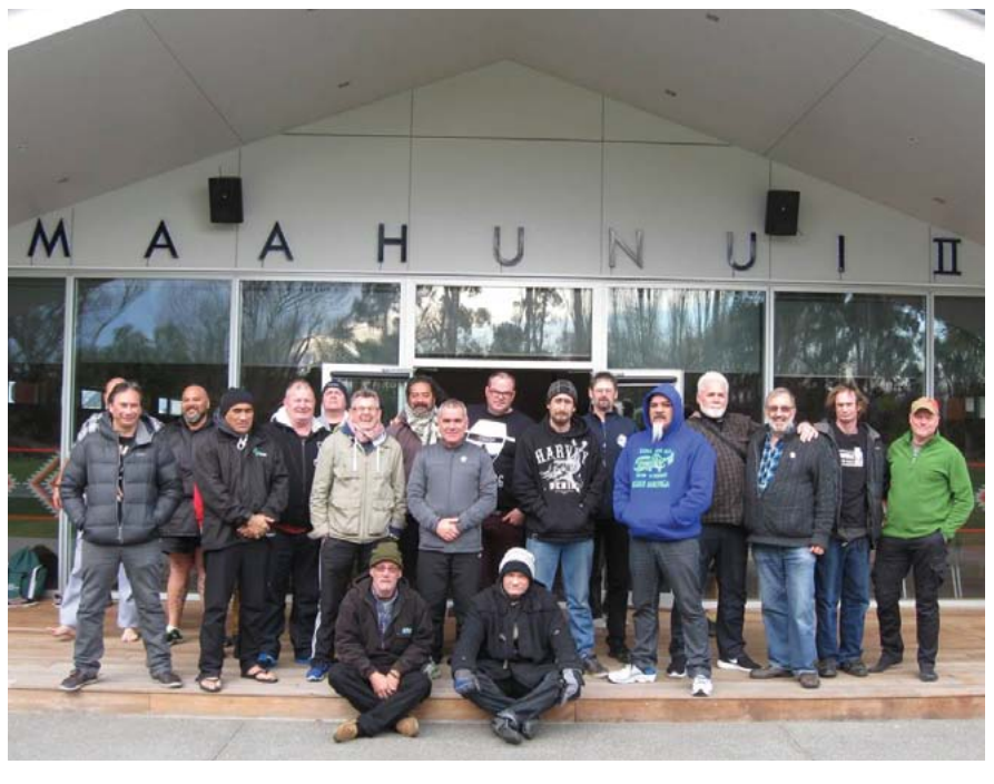
Ready to Be the Change

programme Aviva has been developing with support from the Dublin St Trust. That programme received a lot of positive feedback from participants, including representatives of the It's Not OK campaign, who are keen to access the programme's resources and see it extended to other regions.