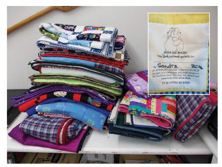
Handmade love for the children using Aviva's services

• Smith City, for supplying us with a new dishwasher