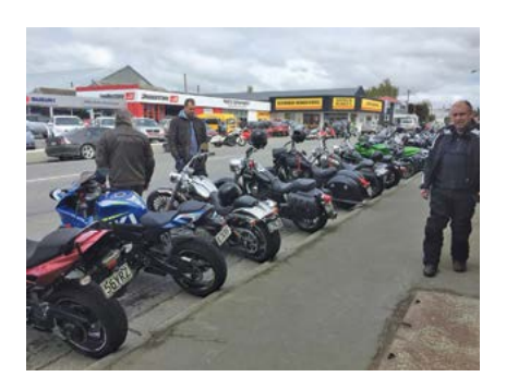
Getting Ready for the Stands Up Ride 2018