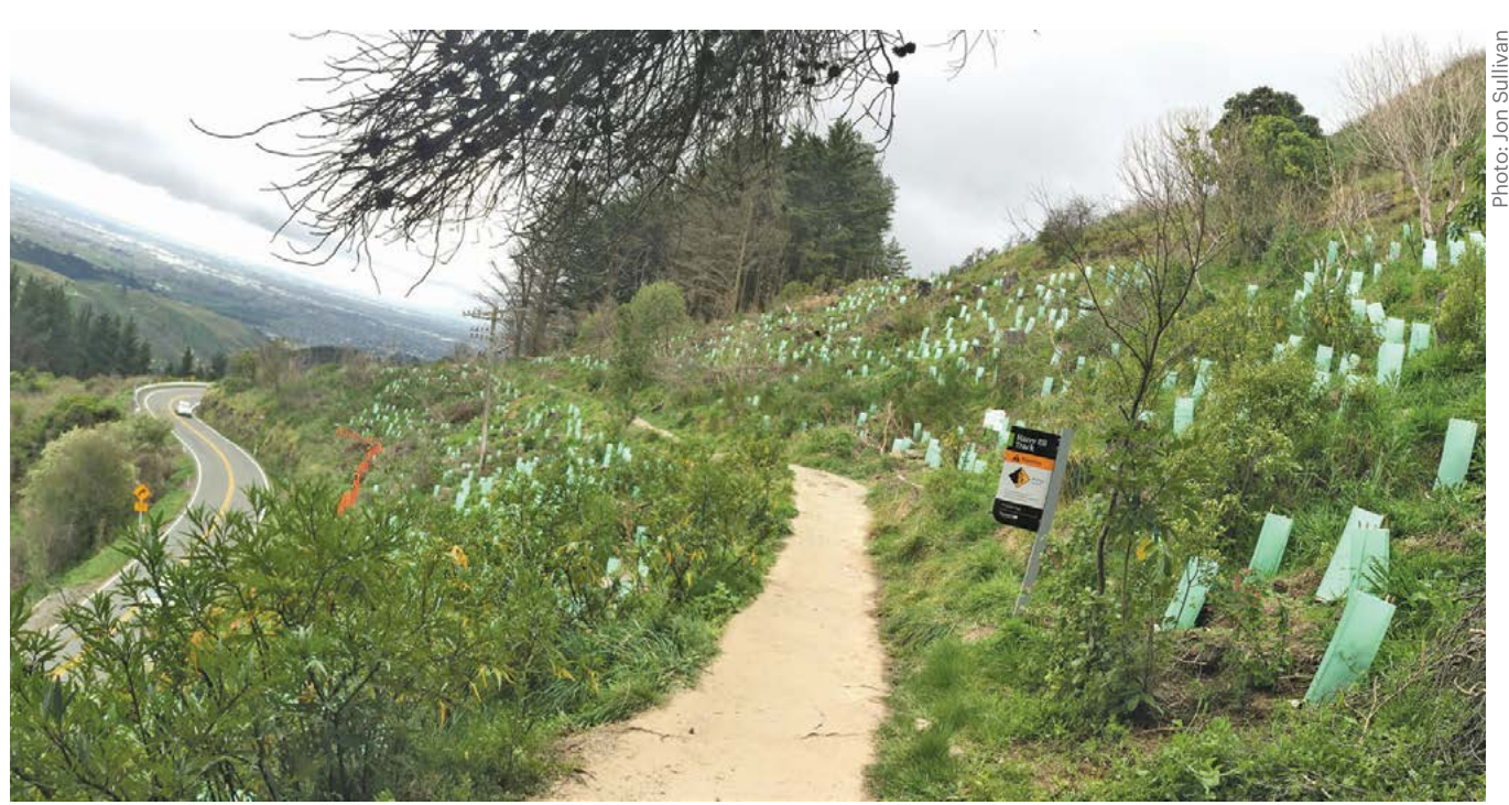
Harry Ell Track, September 2018

"Up on that hill, I was quite surprised that it didn't take long for trees to come back from something dark to something green and beautiful again. That's what I relate to with my situation – Aviva is what has helped me to regenerate." Now, her journey has only just begun.