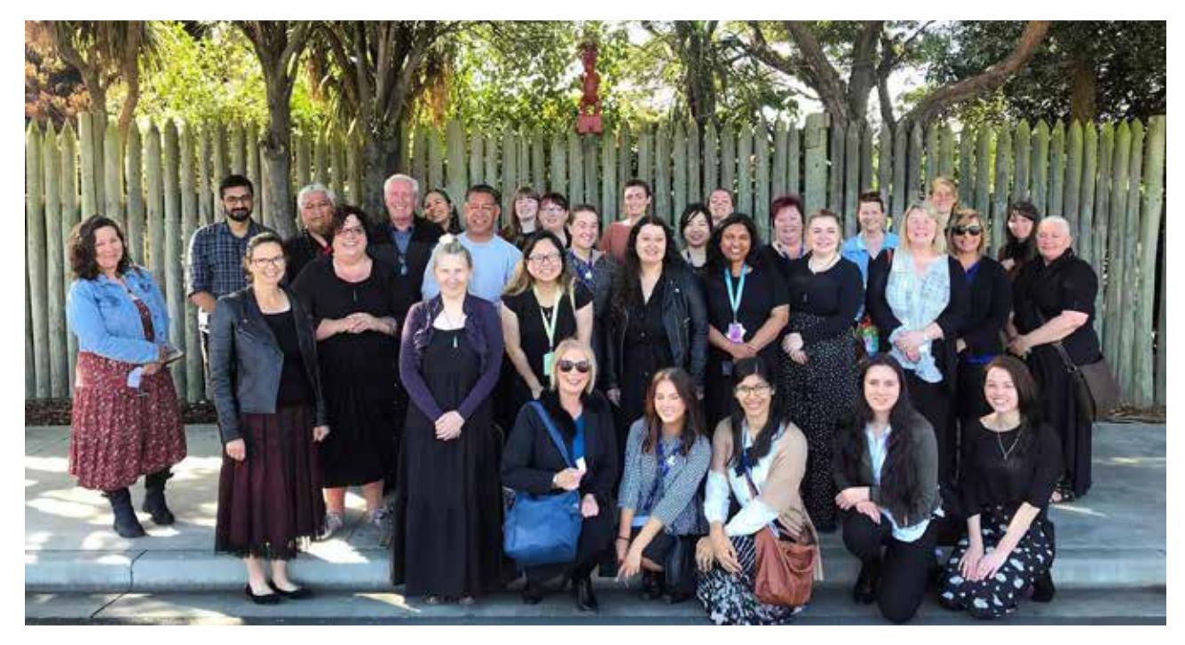
Aviva staff visit to Ngā Hau e Whā National Marae

From a fundraising perspective, we celebrated a hugely successful year, thanks not only to the team, but to the public's generosity. We were also well supported by our funders and the government. We only hope that, going forward, public support continues to meet the demand for our services.