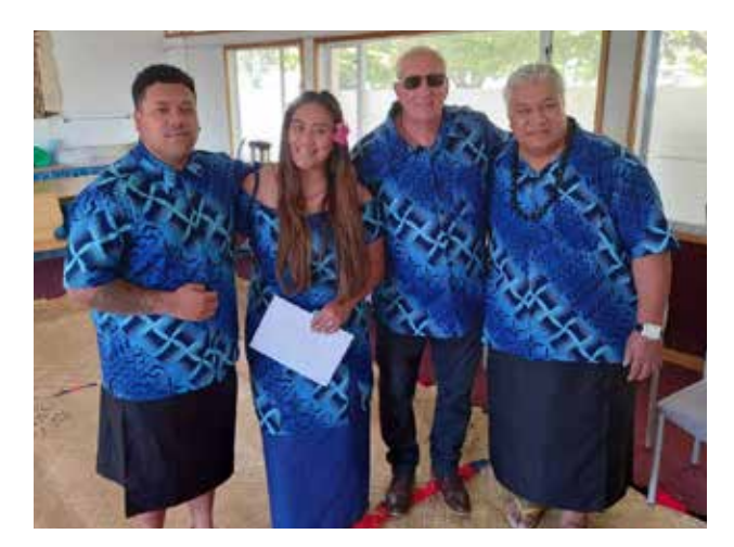
ReachOut team at Seuga Graduation.

Philanthropic funding has enabled us to develop our Seuga service, a Pasifika Men's therapy programme, which contributes to positive outcomes for the men involved. Some men attending the programme are also engaged with other family violence services as