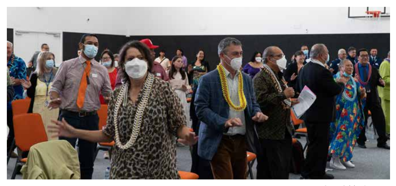
Seuga Celebration event

Philanthropic funding enabled us to develop our Seuga service, initially a Pasifika men's psycho-education programme, which contributed to positive outcomes for the men involved. Some men attending the programme are also engaged with other external family violence services as directed by the court; however, they voluntarily still attended the Seuga programme as it was culturally relevant for them. A particular highlight was the one-year celebration for Seuga in March 2022. In addition, April 2022 saw the start of the Seuga women's group, which provides cultural and family harm education in a Pasifika context.