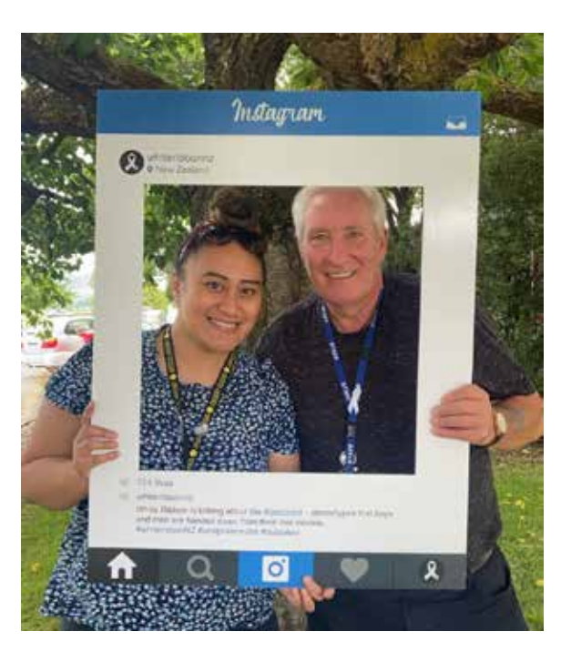
White Ribbon Day